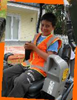
Safety belt on