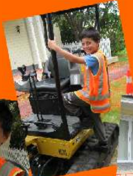
3 point contact