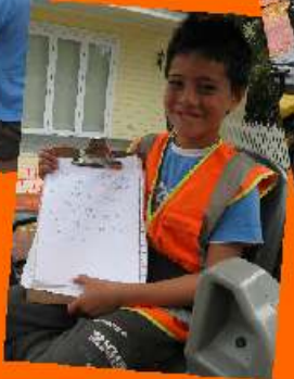
Paper Work Completed